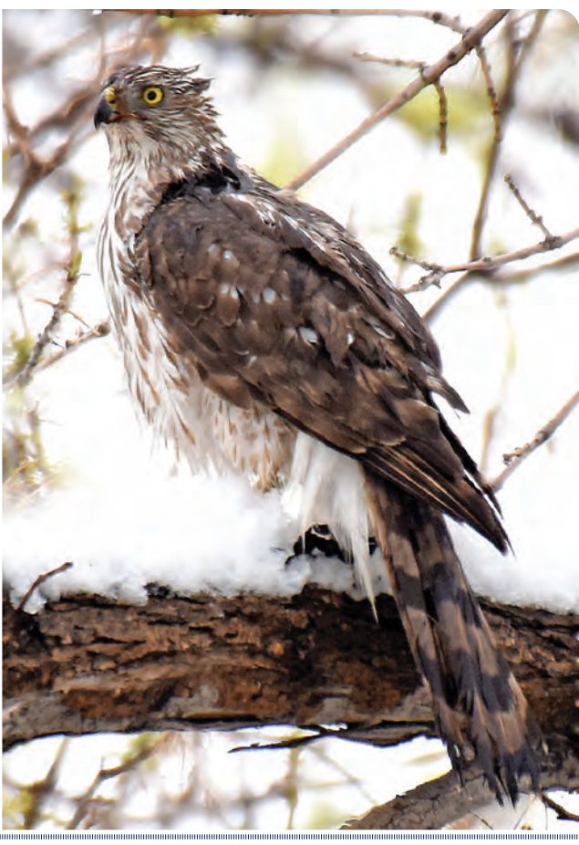
Supplemental Images #1 & #2—Cooper's Hawk (right) and Sharp-shinned Hawk (left). How do you tell them apart? That's not a bad question. But, first, make sure they're even accipiters! Despite the rather disheveled look of these two hawks, we can be certain that they are accipiters; note how their wingtips barely extend beyond the undertail coverts. That field mark alone is sufficient to separate ABA Area accipiters from all other raptors in the region. LEFT: Centennial Valley, Beaverhead County, Montana; Sept. 8, 2015. RIGHT: Longmont, Boulder County, Colorado; Apr. 30, 2019.